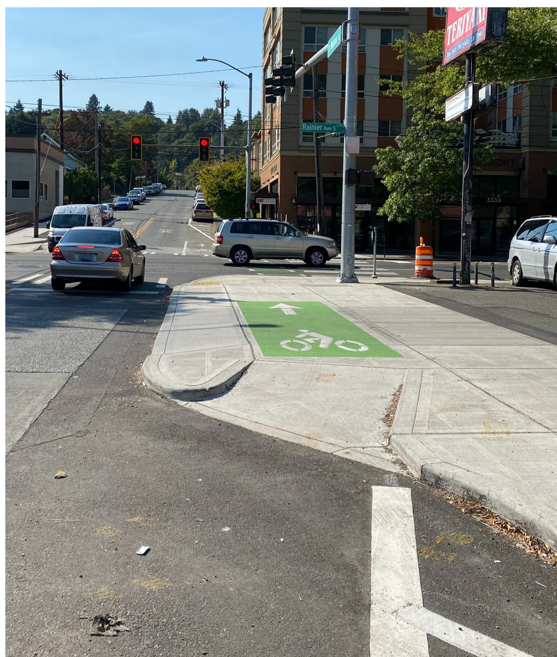
Bulb-out with bike ramp

* = May not be feasible due to trucks on US 395 not being able to navigate a right turn or would require a truck route on King Ave.